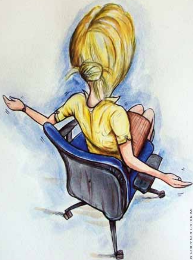
ILLUSTRATION: MARC GOODERHAM