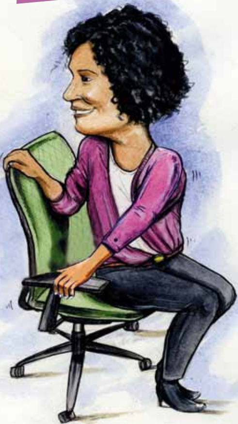
ILLUSTRATION: MARC GOODERHAM