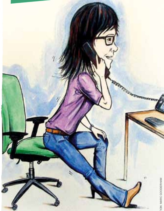
ILLUSTRATION: MARC GOODERHAM