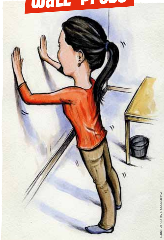
ILLUSTRATION: MARC GOODERHAM